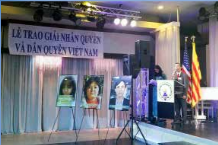
The 2018 Vietnam Human Rights Award Ceremony in Westminister City, California