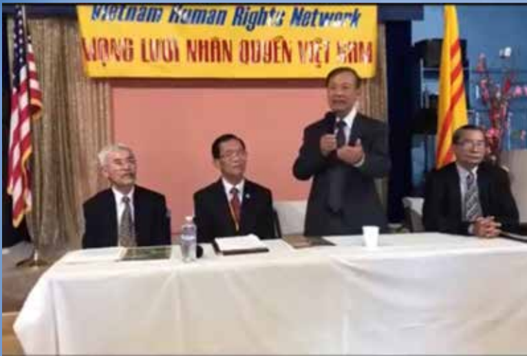
Holding a press conference to announce the annual Human Rights Report, Westminster, on May 21, 2017