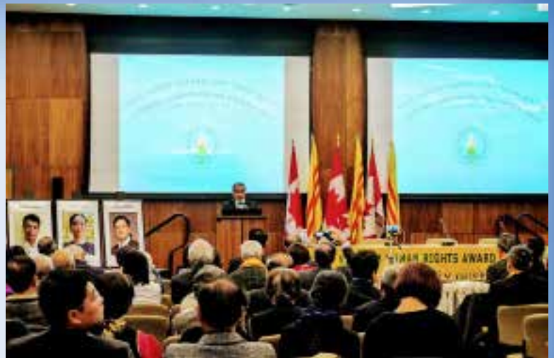
The 2019 Vietnam Human Rights Award Ceremony at the Canadian Senate, Ottawa