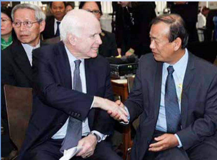
Advocating for human rights with Senator John McCain in Vietnam Human Rights Day 2015.