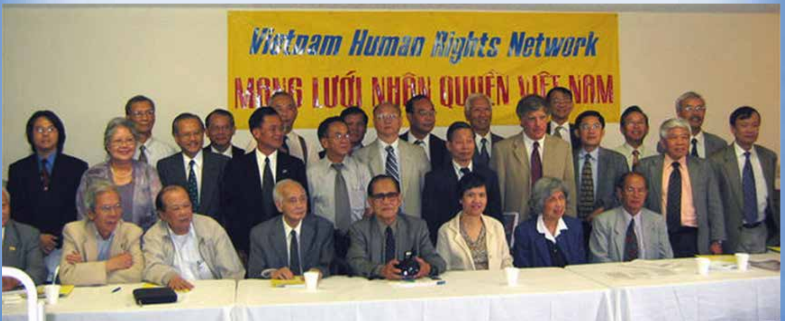
Vietnam Human Rights Network 9th Congress, October 2009, Santa Ana, California