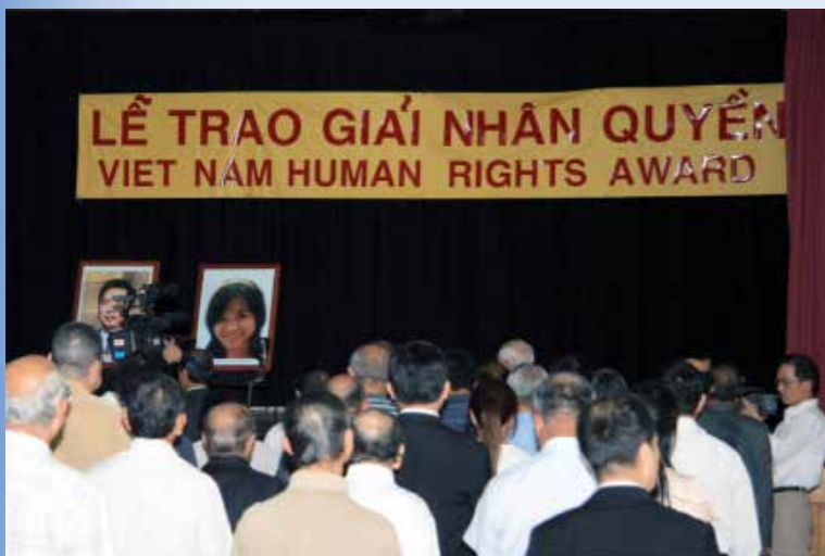
The 2011 Vietnam Human Rights Award Ceremony in Melbourne, Australia