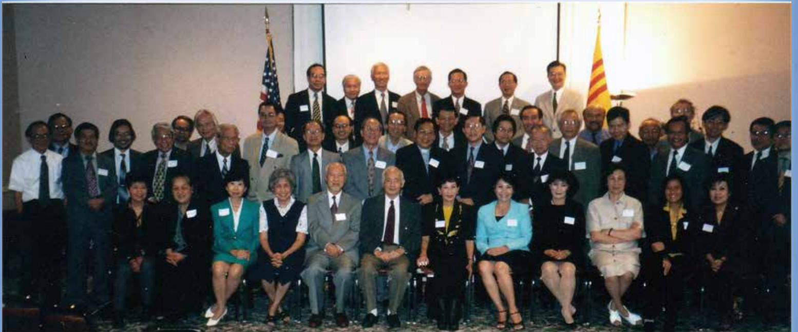
Vietnam Human Rights Network 3rd Congress, October 2000, Santa Ana, California