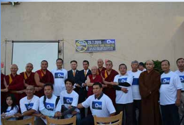
Joining the campaign "We Are One" on July 25, 2015, in Westminster, California