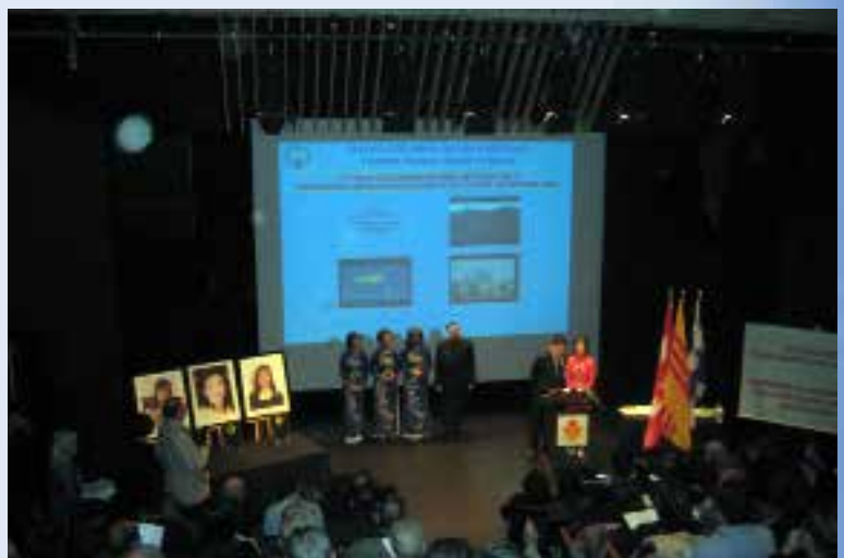
The 2012 Vietnam Human Rights Award Ceremony in Montreal, Canada