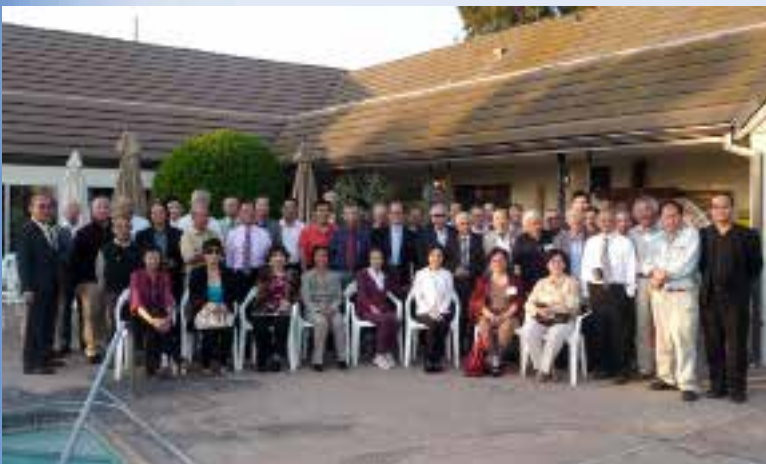
Welcoming the Assembly for Democracy members in Little Saigon, June 2012