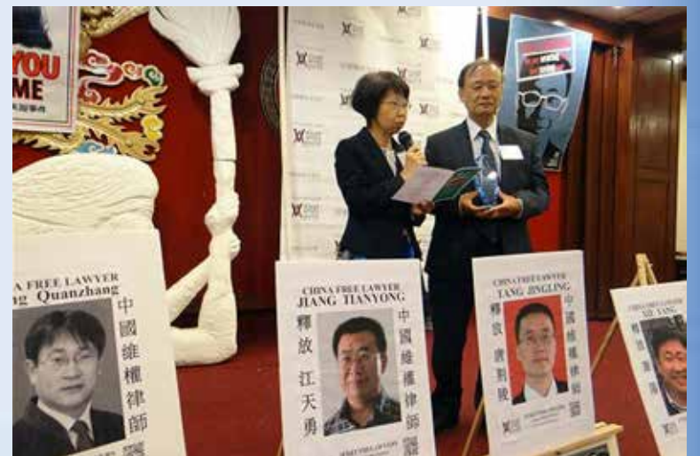
Receiving the Spirit of Tiananmen Award from the Visual Artists Guild on May 27, 2017