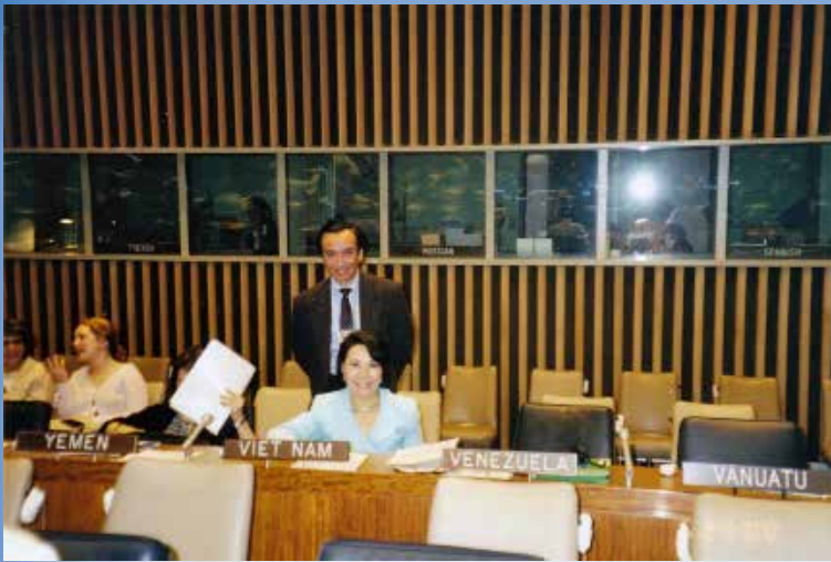
Representatives of VNHRN attended the 2000 Millennium Forum at the United Nations headquarters in New York.