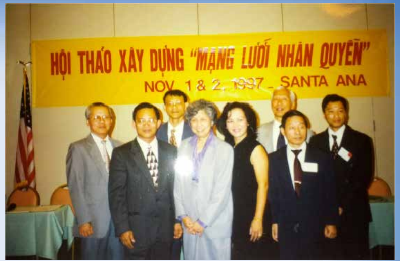
Vietnam Human Rights Network Founding Congress, November 1997, Santa Ana, California