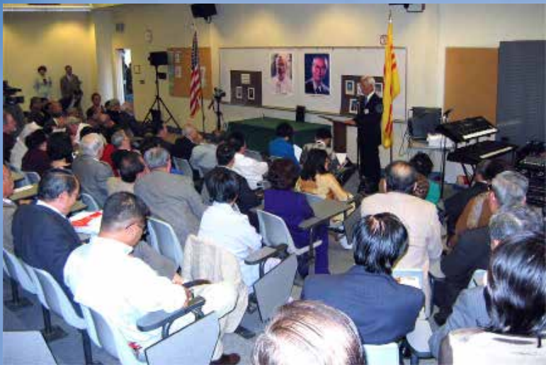
The 2004 Vietnam Human Rights Award Ceremony in Santa Ana, California