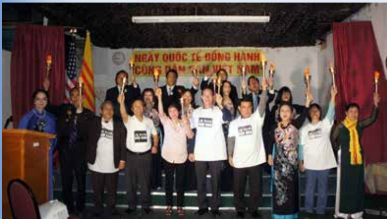
Joining the International Day of Accompanying Victims of Injustice (Dân Oan), February 27, 2016