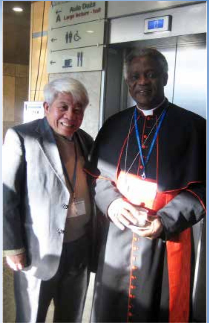
Representative of VNHRN met with Cardinal Peter Turkson, President of the Pontifical Council for Justice and Peace, during the Human Rights Education Conference in Krakow, Poland, in 2012.