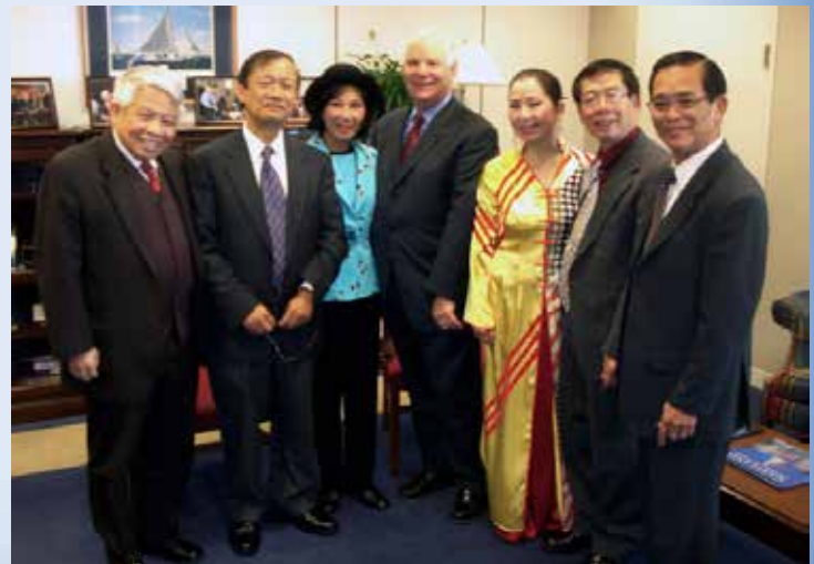
Advocating for human rights with Senator Ben Cardin in December 2009.