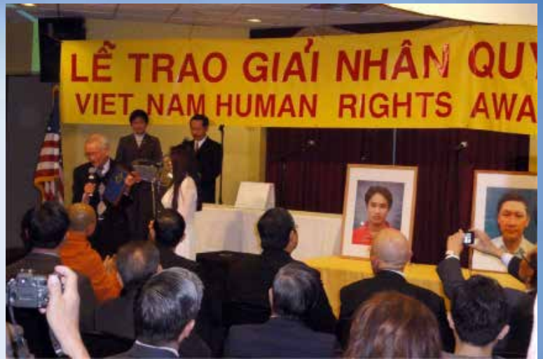
The 2010 Vietnam Human Rights Award Ceremony in Houston, Texas