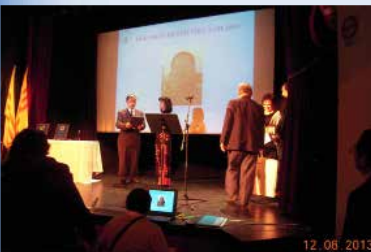
The 2013 Vietnam Human Rights Award Ceremony in Paris, France