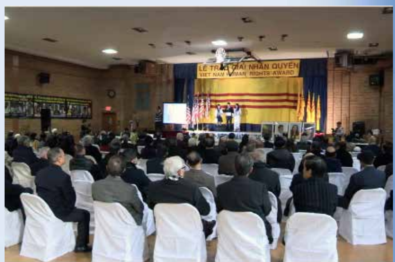
The 2016 Vietnam Human Rights Award Ceremony in Boston, Massachusetts