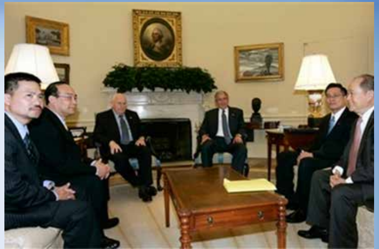
The representative of VNHRN met with President Bush and Vice President Cheney on May 29, 2007.