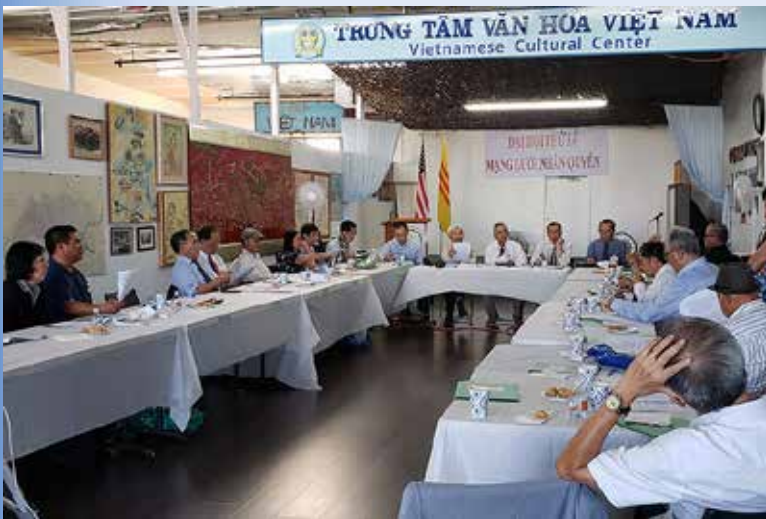
Vietnam Human Rights Network 14th Congress in Little Saigon, 2019