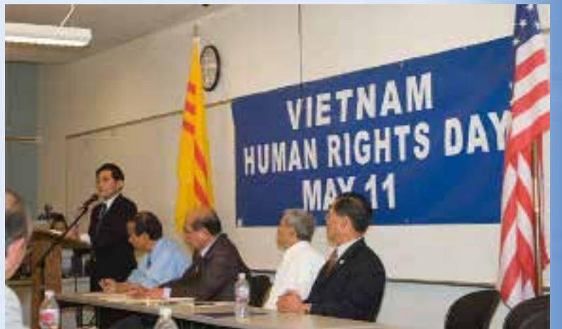
Human rights seminar on the Vietnam Human Rights Day in Little Saigon, May 2008