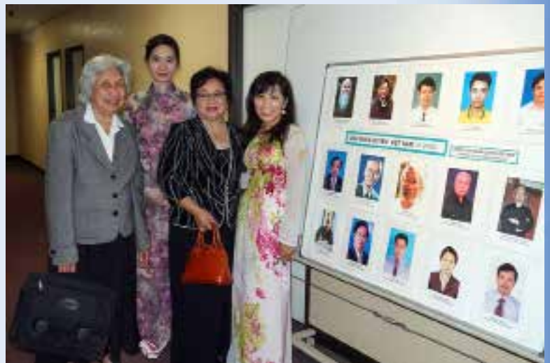
Members from France and Canada attended the 11th Vietnam Human Rights Network Congress in Little Saigon, 2013