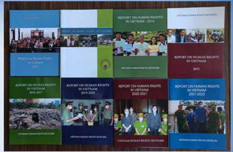
Publication of the Human Rights Report in Vietnam annually in Vietnamese and English since 2009